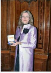
Erika Lovelady Prize